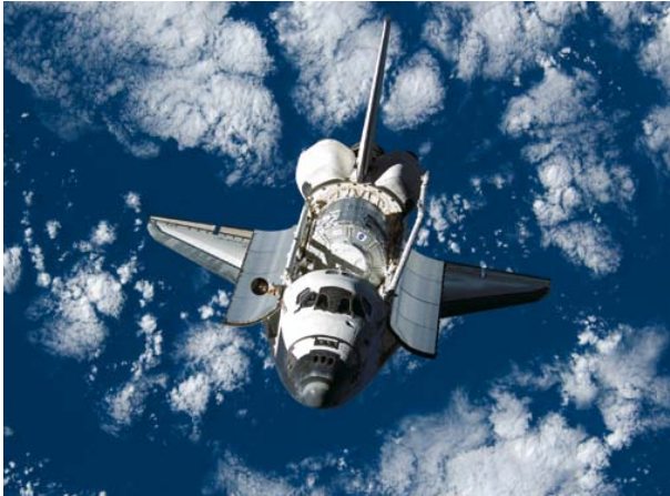
Space Shuttle Discovery

tems and more than 30 laboratories in Moscow, Leningrad, Obninsk, Sverdlovsk, Chelyabinsk, Omsk and Novosibirsk take part in so called “supersensitive arms race” made American Congress worry and allowed to provide new investments into research work. In the further budget projects a share for this purpose was increased up to USD 450 million per annum.